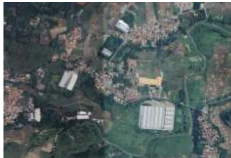
Figure 1. Location Map of the Cibogo KM 9 Road Segment, Padaasih Village, Cibogo, Subang

The study focuses on the Cibogo KM 9 road segment in Padaasih Village, Cibogo Subdistrict, Subang Regency (West Java) with a length of \pm 2 km, from “Cuci Steam Mobil & Motor Dua Putra” to “Kontrakan Pak Musli.” This segment connects residential areas, public facilities (Pertamina gas station 34.412.20, Alfamart), and industrial areas around PT LEN Technopark and PT Patna Lestari, making it strategically important for local movement. The location map and existing conditions refer to Google Earth imagery observations (2025) in the project document.